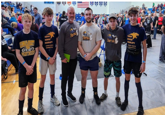
Above: The Powerlifting team poses for a photo.