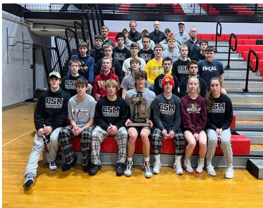
Above: Team Hybrid poses with their Regional Championship trophy.