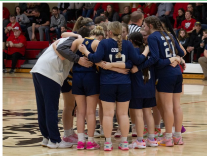
Above: The girls huddle up with their coach before the championship game)