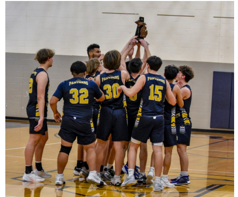
Above: The boys hoist their District Championship trophy!

"It feels great to break that 10 year streak and it's amazing, we love it."