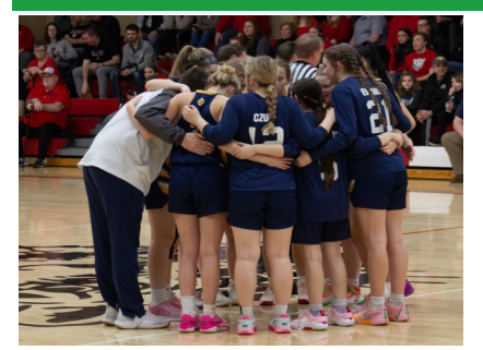
Above: The girls huddle up with their coach before the championship game)