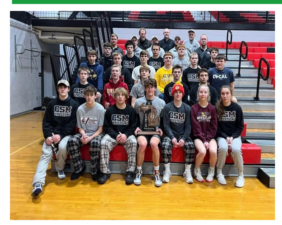
Above: Team Hybrid poses with their Regional Championship trophy.